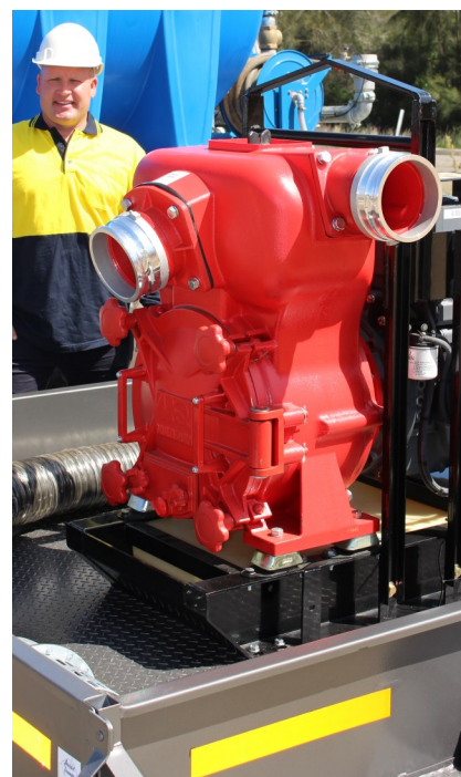
Road registrable trailer option available

Due to our program of continuous product development the manufacturer reserves the right to alter specifications without notice.